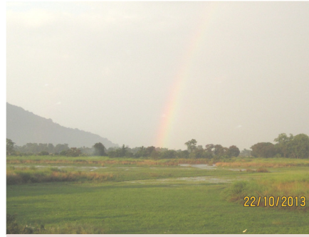
A rainbow of promise on the way

promise to not destroy the earth but offer grace and mercy to everyone who would turn to the true God in true worship. We will share the 'Diamasa Project' with you detailing how you may be involved in this school project.